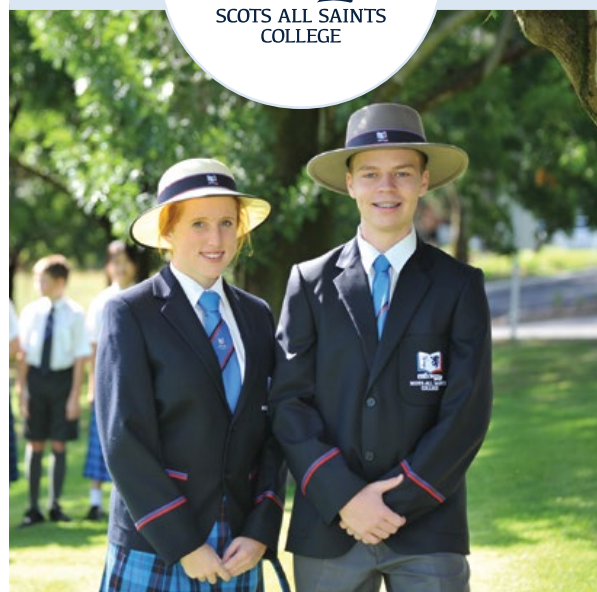
Scots All Saints College